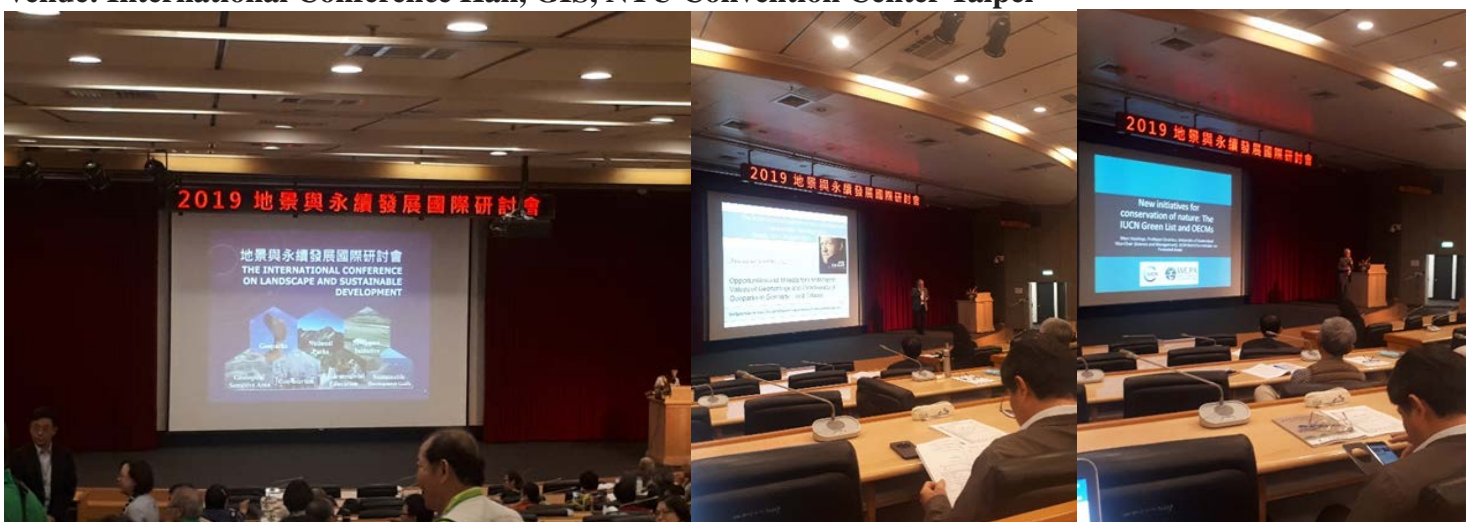
Open ceremony and keynote speakers

Venue: International Conference Hall, GIS, NTU Convention Center Taipei